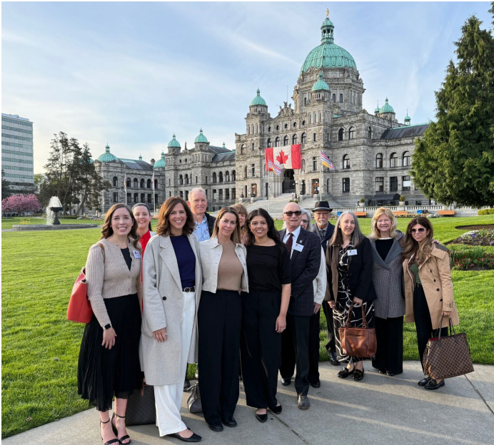
On April 14, 2025, Foundation board members, advocates, staff, and patients met with MLAs to raise kidney health awareness and highlight investment needs.

One in 10 Canadians live with kidney disease — a disease which has been described as a silent public health crisis affecting more than 4 million people in Canada. Driven by an aging population and increasing rates of diabetes and hypertension, its prevalence is projected to rise to more than 6.2 million Canadians by 2050. There is no cure for kidney failure, and approximately 50,000 Canadians living with kidney failure are receiving life-sustaining dialysis or have had a kidney transplant. Currently the 11th leading cause of death in Canada, kidney disease is also one of the nation's costliest chronic diseases.