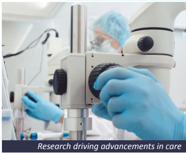
Research driving advancements in care